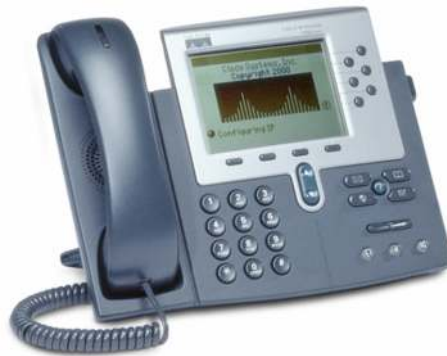
Figure 1. Cisco Unified IP Phone 7960G

The Cisco Unified IP Phone 7960G, a key offering in the IP Phone portfolio, is a full-featured IP phone primarily for manager and executive needs. It provides six programmable line/feature buttons and four interactive soft keys that guide a user through call features and functions. Audio controls for duplex speakerphone, handset and headset. The Cisco Unified IP Phone 7960G also features a large, pixel-based LCD display. The display provides features such as date and time, calling party name, calling party number, and digits dialed. The graphic capability of the display allows for the inclusion of such features as XML (Extensible Markup Language) and future features.